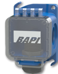
BAPI-Box Crossover (BBX)