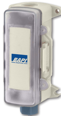
BAPI-Box 2 (BB2)