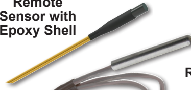
Remote Probe with FEP Cable